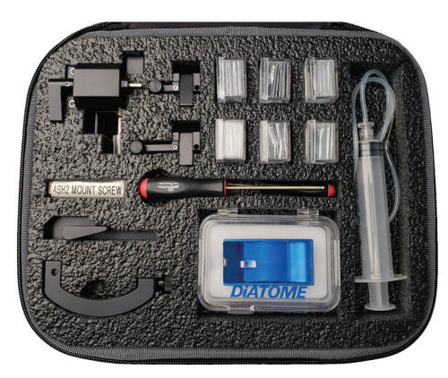
73328 - ACCESSORY KIT (OPTIONAL ACCESSORIES SHOWN)