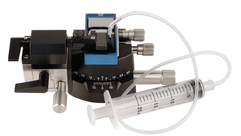
73327 - WATER FILL SYSTEM